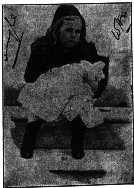
A Little Nursemaid.

Hoping to see this first letter of mine in next month's issue, wishing the W.H.M. a successful future, I will sign myself, Young Lochinvar.