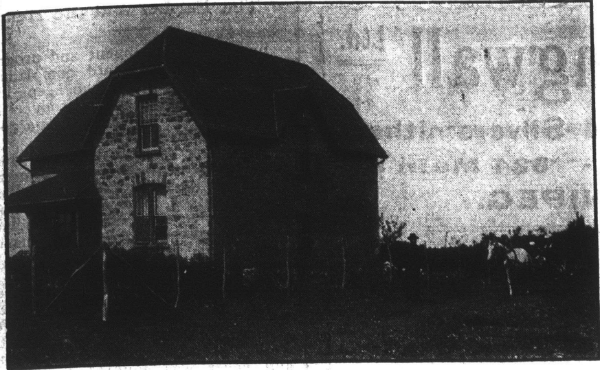
INDIAN MISSION ON THE INDIAN RESERVE SOUTH OF SINTALUTA.