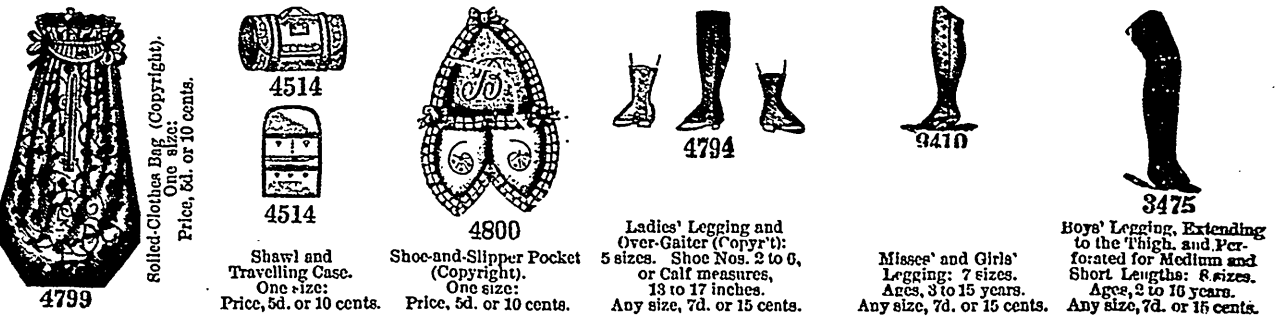
4799 Rolled-Clothes Bag (Copyright). One size: Price, 5d. or 10 cents.