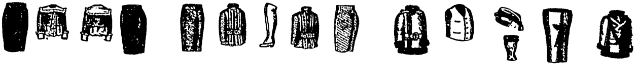
Boy Dolls' Set No. 136, Blouse, Jacket and Short Trousers (Copyright): 7 sizes. Lengths, 12 to 24 inches. Any size, 10d. or 20 cents.