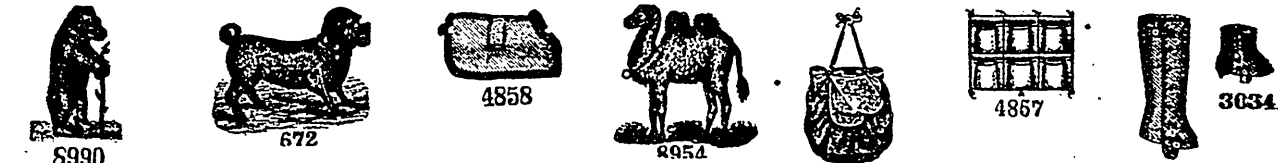
8990 Pattern for a Bear: 3 sizes. Heights, 8, 10 and 12 inches. Any size, 5d. or 10 cents.