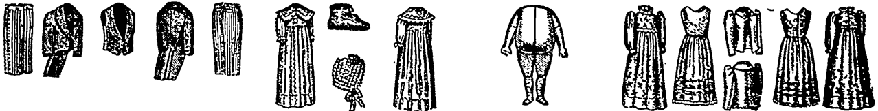
Gentleman Dolls' Set No. 99, Dress Suit—Pants, Swallow-Tail Coat, and Low-Cut Vest with Rolling Collar: 7 sizes. Lengths, 12 to 24 inches. Any size, 10d. or 20 cents.