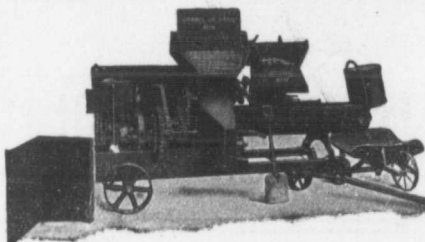
Furnished with Steam, Gasoline or Electric Power.

The Eureka Concrete Mixer is adaptable to all kinds and classes of work. Easily moved and ready for work instantly when on the job. The measuring is automatic and guaranteed accurate and reliable.