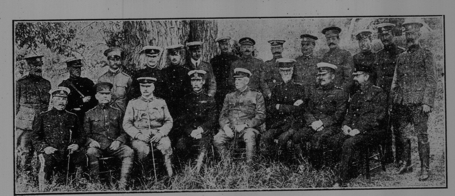
THE STAFF OFFICERS NOW ATTENDING CAMP SUSSEX.