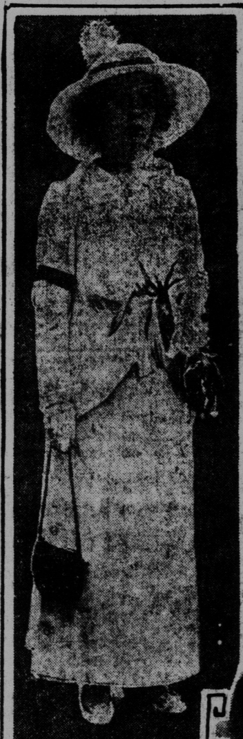
LILIAN LENTON WHO SLIPPED THROUGH A CORDON OF TWENTY BRITISH DETECTIVES