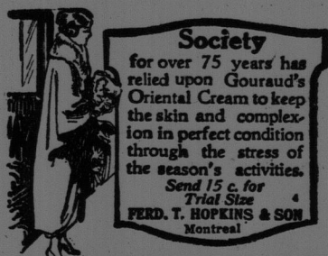
Gouraud's Oriental Cream