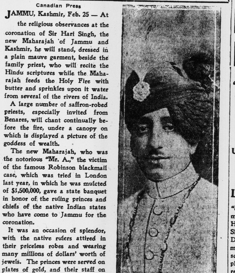
SIR HARI SINGH