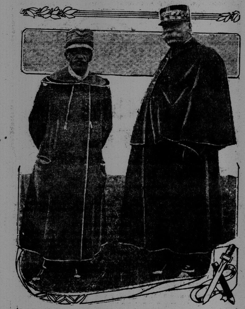
Photo taken on the occasion of the French Commander's recent visit to the Italian Front.