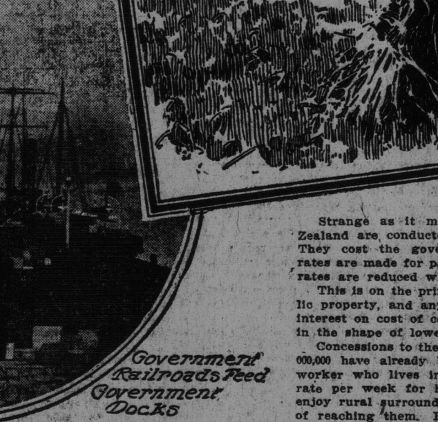
Government Dock

If a tenant does not care to conduct himself as to hold possession, there are others willing to take the land and assume the obligations. Then, too, there are provisions by which the government can buy back and take over land which is slovenly cultivated or not cultivated at all, and lease it again to better tenants.