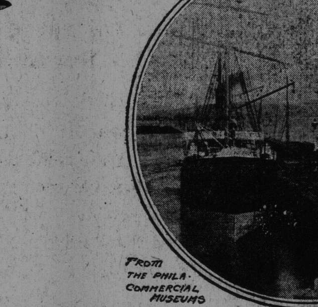
Government Dock

When New Zealand's accomplishments are epitomized in the statement that she has virtually abolished poverty, banished crime and installed a most remarkable demonstration of peace, prosperity and good will among men—all through legislation and assumed governmental functions—one feels inclined to say, "Let's stop and take a look at that country, anyway."