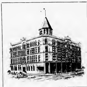
The Gilmour, Ottawa.

The last lock is Hartwell's, about two miles from Ottawa. Passing through it the steamer enters Mutchmore's Cut, the shores of which are lined with cedars and summer residences. The deep cut, about a mile in length, is navigated and the steamer drops into the basin at Ottawa. The "James Swift" leaves Ottawa for Kingston every Tuesday and Friday at 3 p.m.