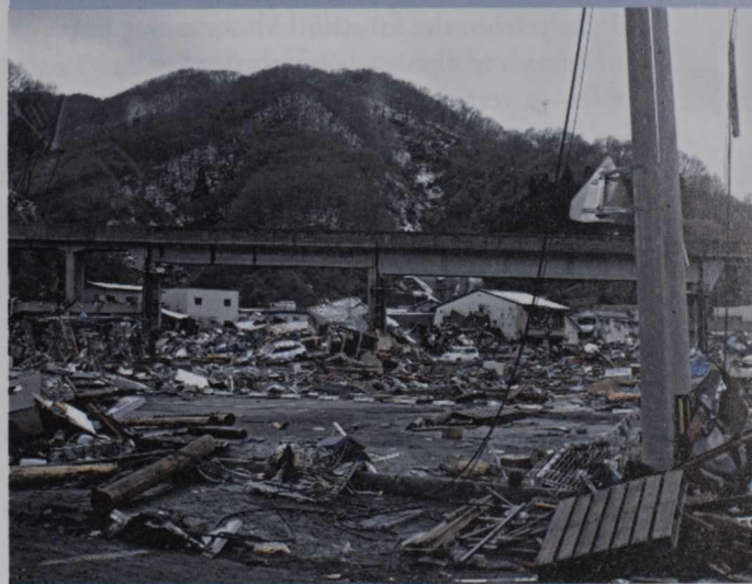
Devastation in Kamaishi