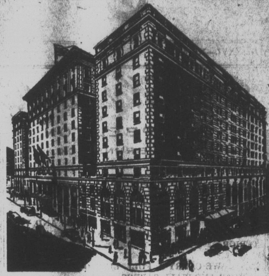
The Largest Hotel in the British Empire

Dreo is being specially introduced in Campbellton by Wren's Drug Store, and is sold by a good druggist everywhere.