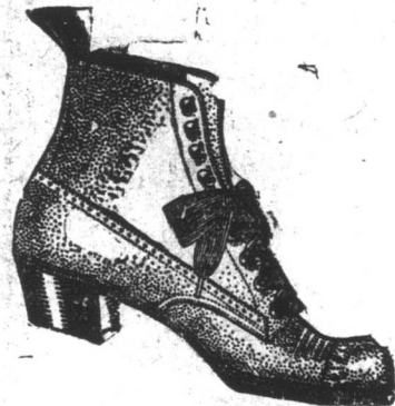
Only $4.75 Men's Dark Tan Laced boots

in Black and Tan Leathers, reduced from $9.00 to $6.50 the pair. The very best value ever offered in Men's Boots for $6.50 in Newfoundland.