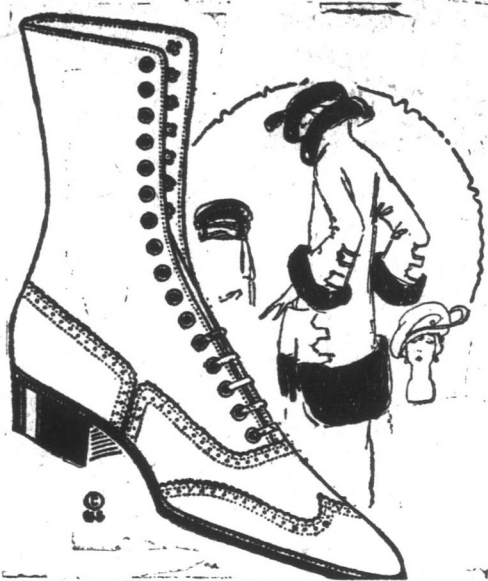
EVANGELINE SKATING BOOTS in Black and Tan Leathers. Price $6.99.

We also offer our customers the balance of our EVANGELINE BOOTS, SHOES and PUMPS at $6.99 the pair. Sizes are being fast depleted in these well known shoes for ladies.