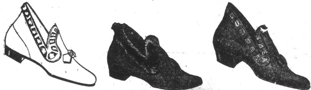
WOMEN'S FELT SLIPPERS.

BEDROOM SLIPPERS, HOUSE SLIPPERS in many handsome designs at $1.70, $1.80, $2.00, $2.20 and $2.50