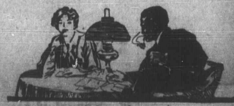
protects your home, and—