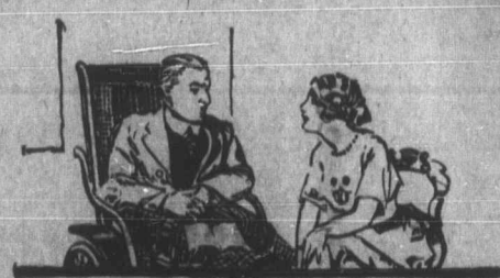
if you become permanently disabled—