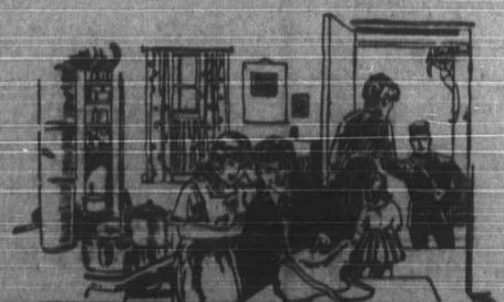
guarantees $5,000 to your family.