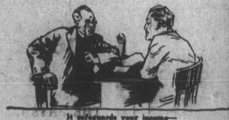
It safeguards your income—