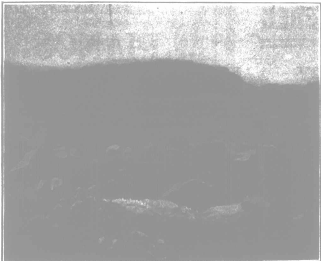
Result after using Stumping Powder on boulder, shown in our issue of May 5th.

Is just the thing to do the work, quickly, very little labor, and at small cost.