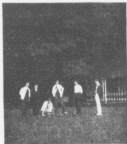
Bowling on the Green

“THE Old English Game of Bowling-on-the-Green” is a popular diversion with all the Homewood residents. The turf of the bowling lawns resembles a first-class Wilton carpet, and they are as level as a billiard table. The