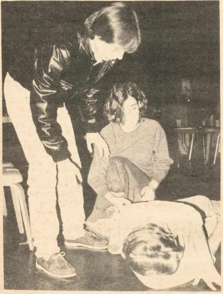
No, it's not students looking for a contact lens, it's Dal actors in The Shadow Box last week at the Dunn Auditorium.