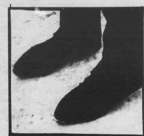
Biggest Toe Jam competition