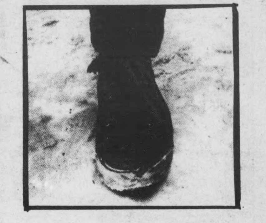
A "whose are these sneakers" contest