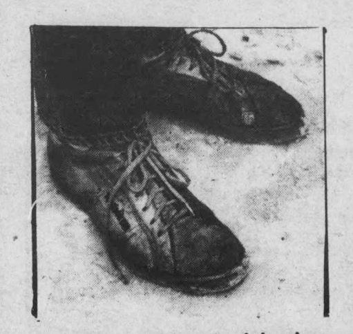
Greater sneaker participation

Q: What would you like to see for Winter Carnival?