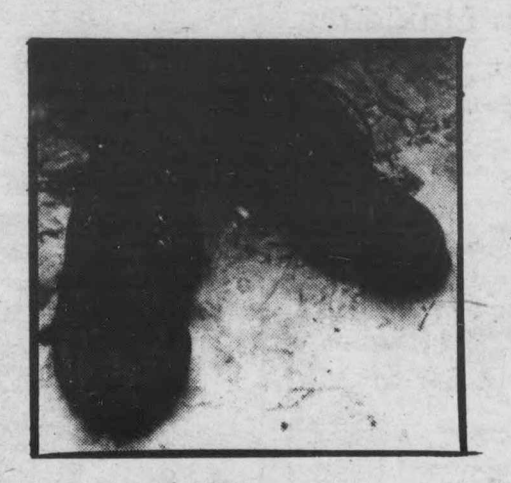
Some "sole" music