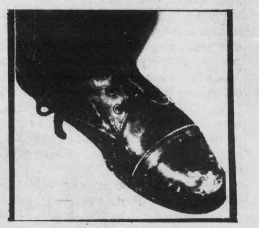
An ugly boot contest