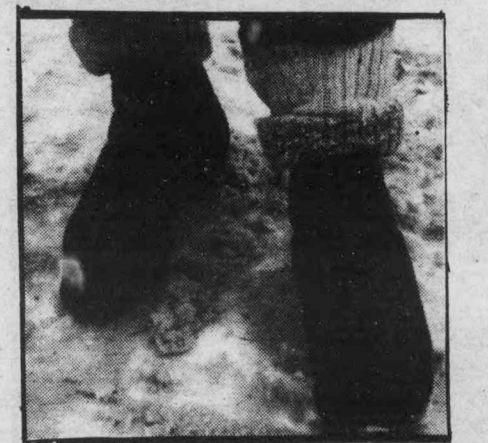
A wet sock competition