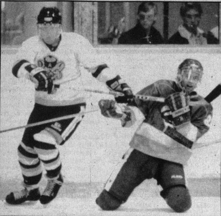
The Golden Bear defence is hoping to bring all of its opponents to their knees this year.