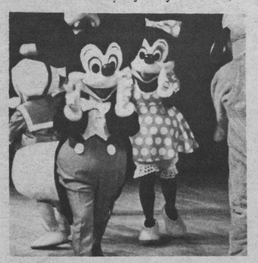
Disneyland characters delighted those who attended their 25th anniversary celebration January 9.

The Students' Union boat people arrived one blustery day in early