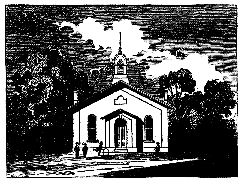
PLAN NO. 3. FRONT PROSPECTIVE WITH GROUNDS &C. FIG. I.

The material in this building may be stone or brick; and for the slight change will not only save space, but turn the eyes of the arrangements of the interior, reference is made to the plans and explanations of the same.