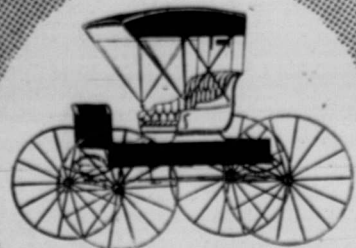
No. 422 Either solid rubber or Cushion Tire