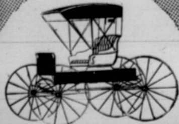
No. 216 Either solid rubber or Cushion Tire