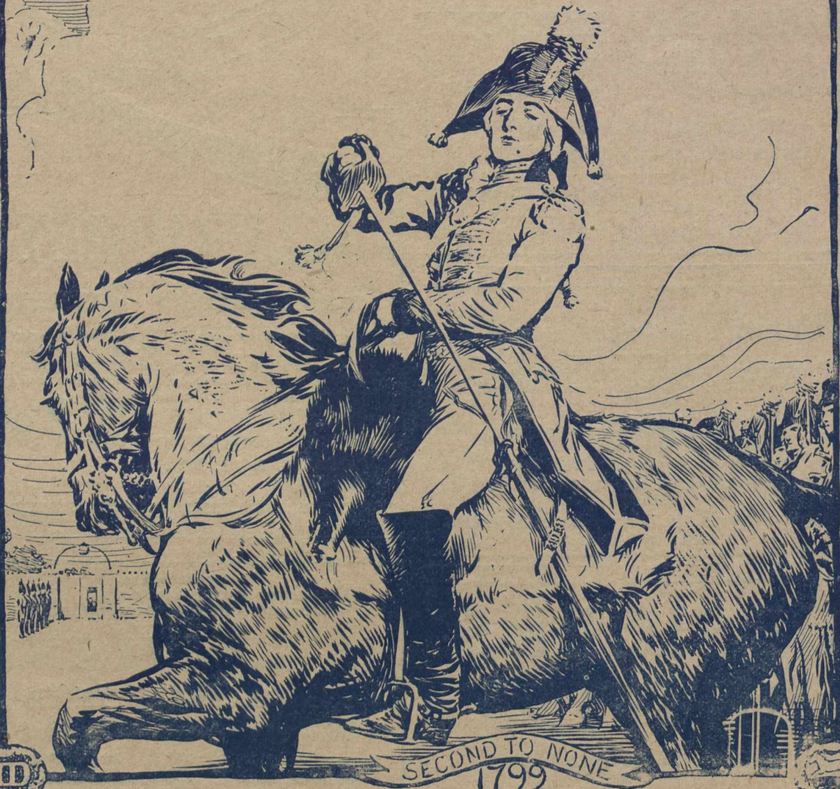
The "Greys," 1799. Shortly after this date the powdered wig for military wear was discarded.