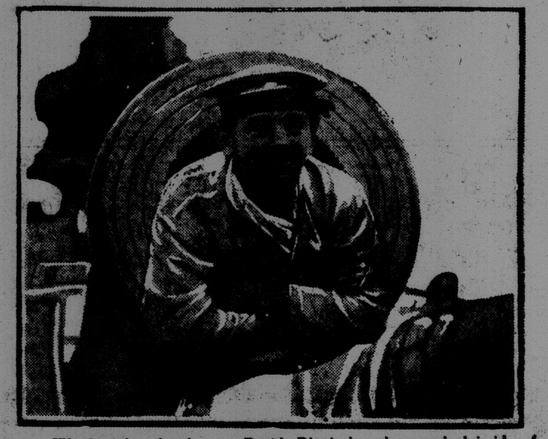
Worthy of each other—a British Bluejacket photographed in teen-inch guns of H.M.S. Queen Elizabeth, at the Dardenelles