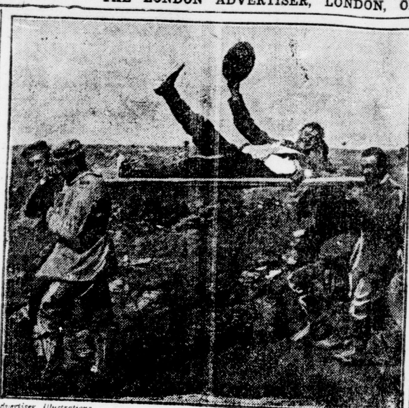
Advertiser Illustration. Striking war pictures by the British official photographer, from the western front. The British regimental sergeant-major came along, carried by four German prisoners, shouting to the reserves going up, "Good boys—let 'em have it."

One or two newspapers, however, interpret the change in command as the first step in a "stronger" policy by the Entente Allies towards Greece. The Daily Mail, quoting the statement of deputies that "tomorrow" a new front will be formed, says it is difficult to see how this can point anywhere but to Greece, but remarks that it is not clear whether Premier Briand used the word tomorrow rhetorically or literally.