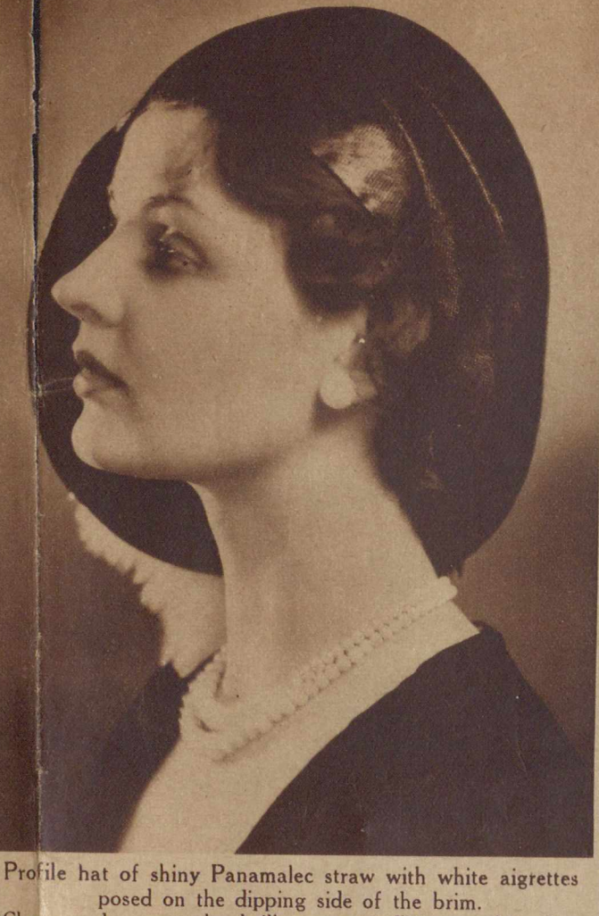
Chapeau de panamalec brillante garni d'aigrettes blanches posées sur le coté incliné du bord.