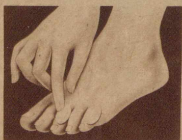
100% SAFE! poisoning as with cutting your corns, or of acid burn which harsh liquids and plasters often cause