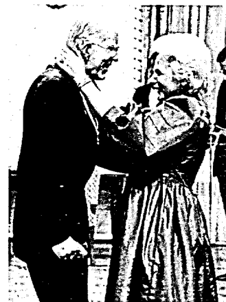
Stanley Knowles receiving an Order of Canada award from Jeanne Sauvé.