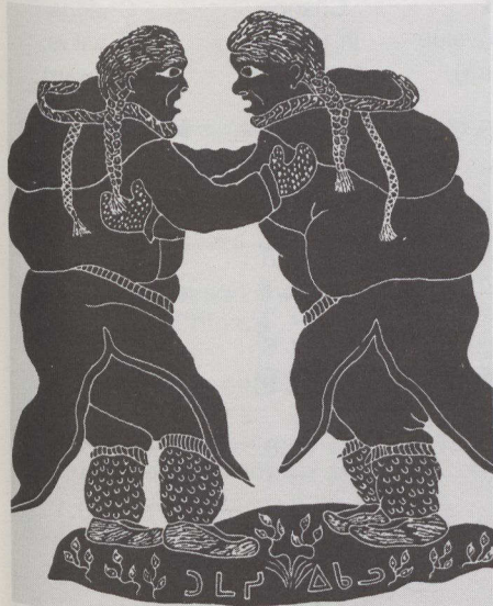
Print by Tucassie Echaluq of Inoucdjouak, Quebec shows Inuit throat singers, two women in vocal competition imitating natural sounds from their environment.

Francisco, Philadelphia, New York and Brunswick, Maine; and Peterborough, Ontario. The Department of External Affairs and the Canada Council are major sponsors.