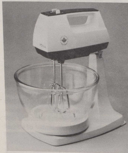
General Signal Appliances' four-speed mixer is easily converted to a hand mixer.