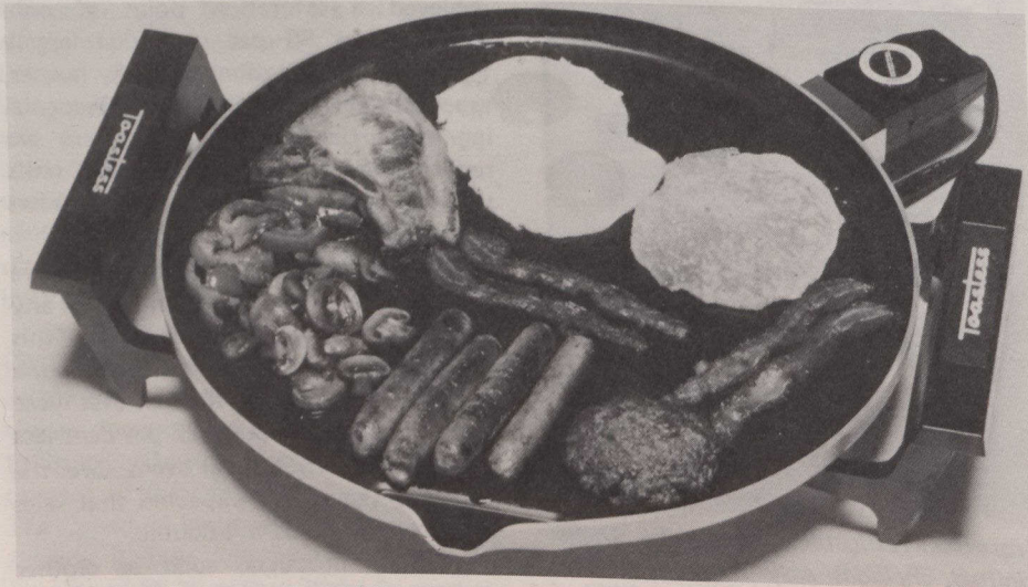
Toastess Inc.'s automatic griddle with non-stick surface can double as a warming tray.

The companies represented at Domotechnica '84 in Cologne, West Germany, February 8-11, are: