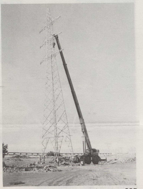
A transmission tower, one in some 965 kilometres of transmission lines now going up as part of a major electrification program in the El Qaseem region.

According to present forecasts the electrification program for the entire 80 000 square-kilometre region should be completed in 1985. The generating station is built on flat desert near the main highway linking the province's two largest towns, Buraydah and Unayzah. On three sides it is bordered by sand dunes and on the fourth by a wadi. To protect the