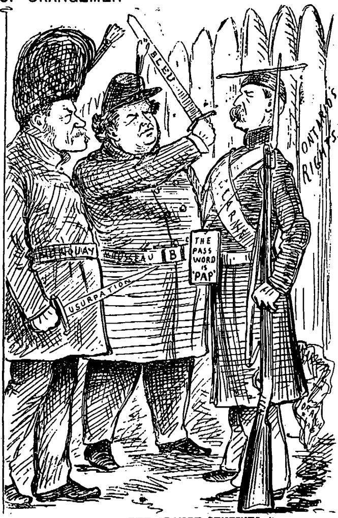
"THE ORANGE SENTINEL." THE SENTINEL.—Who goes there? NORQUAY.—Eemies. THE SENTINEL.—All right: pass in, gentlemen.