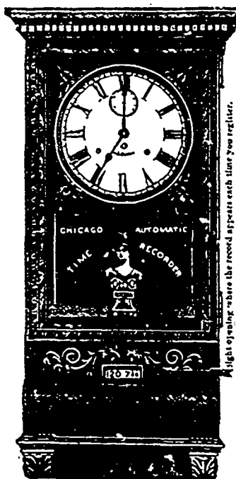
Numerical (or Key) Recorder