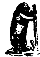
SKIN OF THE BEAR

A SHAGGY COAT Fine Furs are becoming to the robust hardihood of men no less than to the more delicate beauty of women. We have fine furs—made up and uncut—for men and women, and are making some special offerings that should induce your interest. TAYLOR'S Hats and Furs 63 1/2 QUEEN W. Between Markham st. and Palmerston Ave.