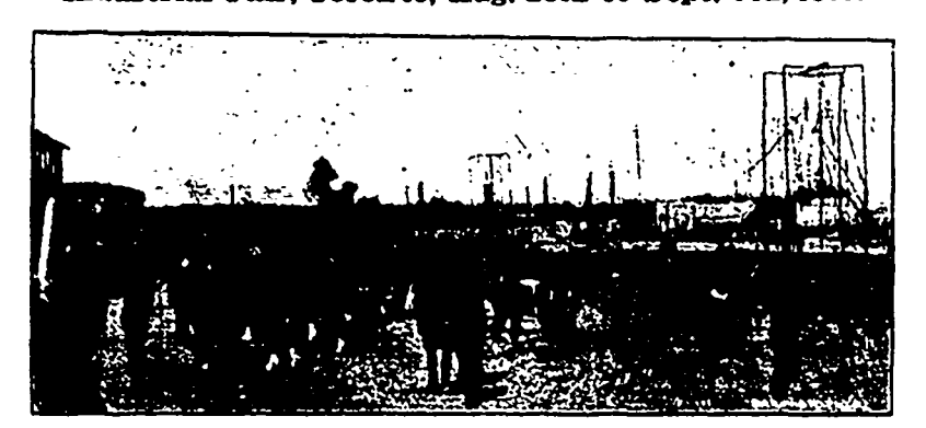
Prize Horses in front of Grand Stand, Toronto Fair, 1898.

Nothing Slow or Out-of-date at Canada's Great Exposition and Industrial Fair, Toronto, Aug. 28th to Sept. 9th, 1899.