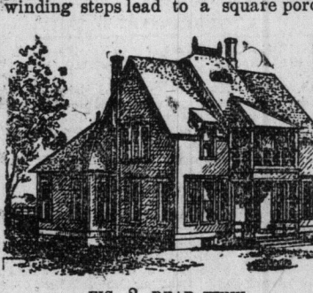
FIG. 2. REAR VIEW. whose curved front affords an extensive

FIG. 1.-FRONT VIEW OF COTTAGE. rear (Fig. 2). The hiproofed wings, at either side, seem to guard the domestic life, affording a restful quiet not often obtained in an exposed location, and the high central roof rising above the porch adds dignity to the whole. The construction of this tentral contractions are settled.