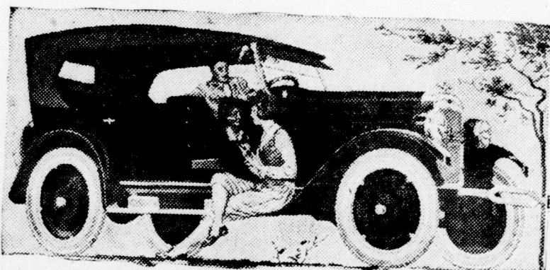
Five-Passenger "Red Bird" Overland Sport Model Touring Car.

The winner of this prize will have his or her choice of either car or $1,000 in cash.