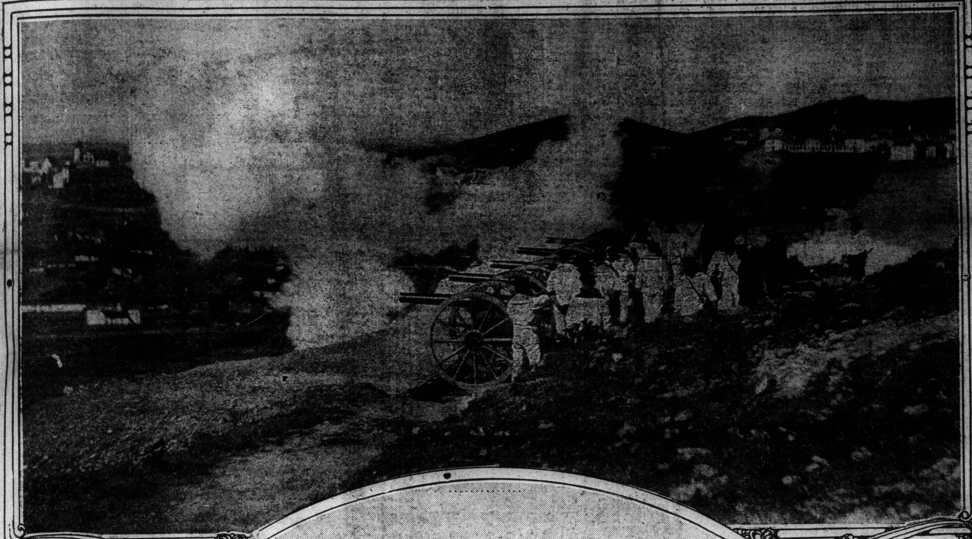
GERMAN ARTILLERY AT TSINGTAU.