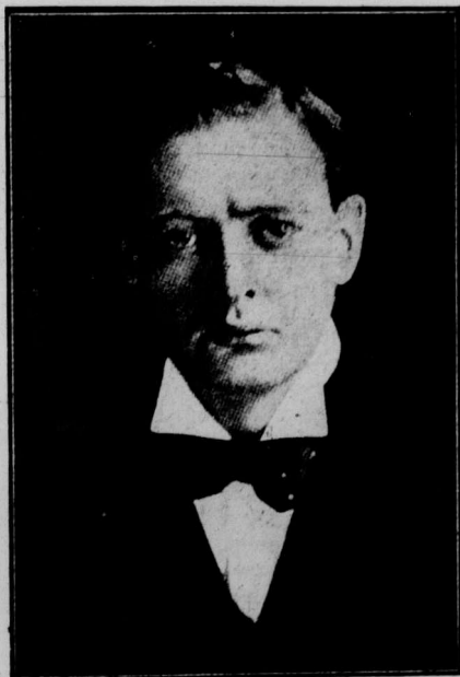
RT. HON. WINSTON CHURCHILL First Lord of the British Admiralty, responsible for the efficiency of the Navy.

It will be seen from the accompanying tables that the nations of the Triple Entente—France, Russia and Britain—with their allies of the Balkan States, have the advantage of their enemies of Germany and Austria-Hungary in land, sea and air forces. It will not be doubted that both in the