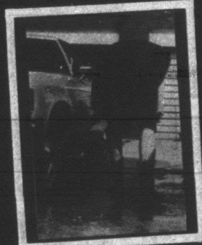
Bending over backwards for customers is OK. But this is ridiculous.