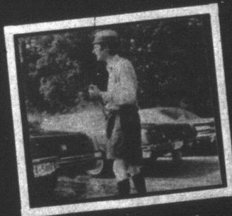
Do I have to do this boss?