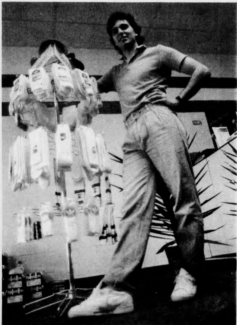
PROUD OF HIS SOCKS: Running for Less, in addition to dealing in shoes, also sells accessories.