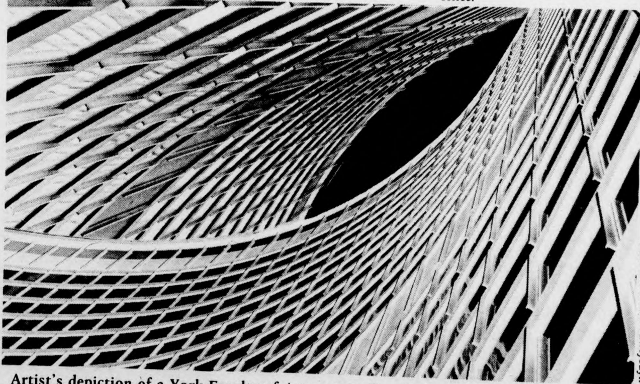
Artist's depiction of a York Faculty of Arts course description catalogue.

Students will be meeting with the administration, and another demonstration has been called for Friday at 1:00 p.m. in front of the President's office.