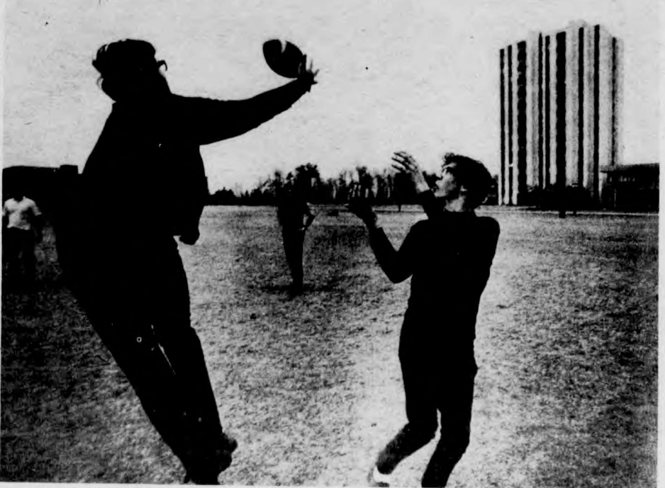
I got it!

The Yeomen visit Guelph U. on Sat. Nov. 15 for a game at 2 pm, and host Western at York's arena on Wednesday, Nov. 19 at 8 pm.