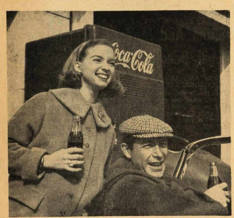
Coke!...its real great taste puts you at your

The foregoing items were culled from the "Trade Winds" column of the Saturday Review, an intelligent weekly publication from New York. Though the main stress of the editorial board is on the weekly review of books currently published, sections are devoted to Science, Hi-Fi and Records and a Travel section. The editorials are alone worth noting for their sincere approach to the settlement of world problems. Browse through a copy at the Dalhousie Memorial Library some afternoon.