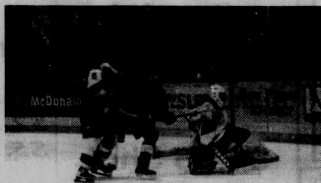
Okay, so were did that darn puck go anyway as UNB defeats STU.