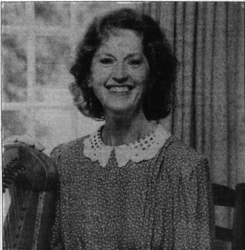
"Songs never leave the mind," says Irish harpist and singer Mary O'Hara.

O'Hara will be performing at the SUB theatre. The original concert date of Thursday October 8th has been moved to October 9th. Tickets purchased for the October 8th date will be honoured at the door, or they may also be exchanged at the Students' Union office.