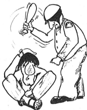
AND BY THE END OF THIS GRUELLING TIMEX TORTURE TEST ...