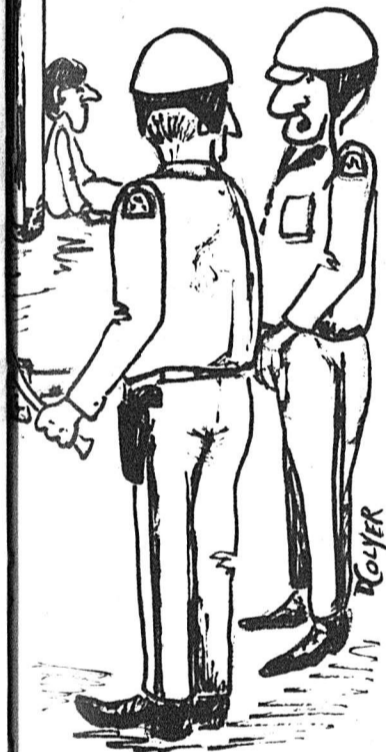
MEAN YOU GET THE AD!"