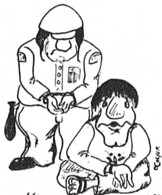
"MY WATCH STOPPED!"