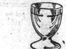
Thin China Egg Cups, gold line decoration, half dozen for. .15