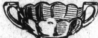
Colonial Glass Double Handled Pickle Dish, each. .7