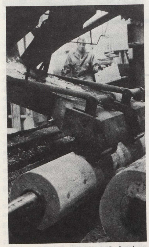
Huge lathe peels a Douglas fir log into sheets of veneer for Canfor plywood. The Canfor Group of companies — Canadian Forest Products Ltd. and its affiliates — is based in Vancouver, British Columbia.

nounced last August. Mr. Andras said that the Federal Government now wanted to: re-examine existing forest-management agreements with the provinces to upgrade them in light of the new push to modernize plants and machinery; and invite British Columbia and other interested provinces to enter into similar agreements.