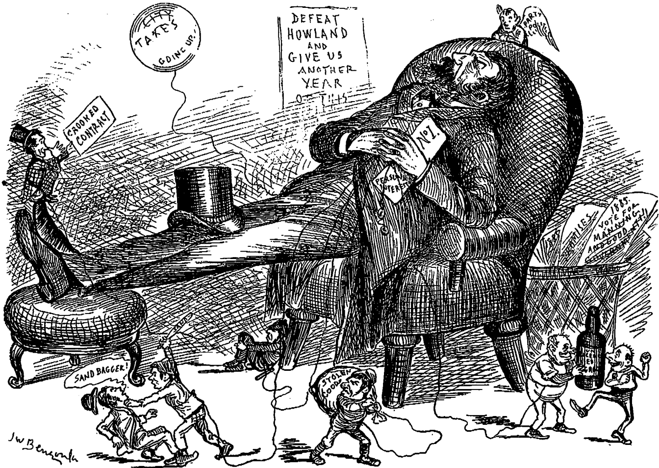
"THE STRINGS HANG LOOSE!"